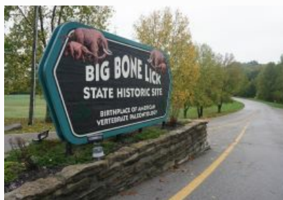
Watch Here What is a Lick?