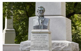
Watch Here William Clark's Grave

A "lick" is a term for a natural occurrence of salt. They usually appear around sulfur springs, which are places where water and minerals bubble out of the ground. People call these places "licks" because animals like to lick the salty deposits. This site was influential in the American development of paleontology