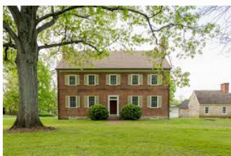
Watch Here Historic Locust Grove