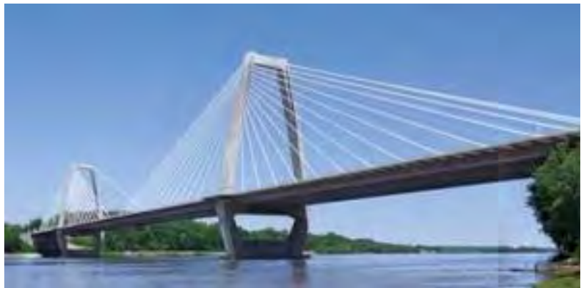
The Lewis and Clark Bridge over the Ohio River. The bridge connects Indiana and Kentucky at Louisville. A campaign by Lewis and Clark enthusiasts encouraged the state to use the Lewis and Clark name.

F or many Lewis and Clark enthusiasts, it was a long journey to the signing of the trail extension into law.