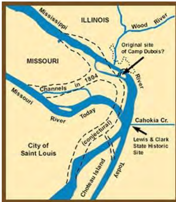
The Missouri meets the Mississippi, then and now: Map of the confluence of the Missouri and Mississippi rivers showing locations when Lewis and Clark were there and stayed the winter of 1803-04 at a camp they built and named Camp Dubois.

The House passed the legislation in July 2018. It was then introduced in the Senate by Sen. Todd C. Young (R-Indiana) and co-sponsored by Sen. Joe Donnelly (D-Indiana). However, the Senate legislation was not acted upon prior to the end of the congressional year.