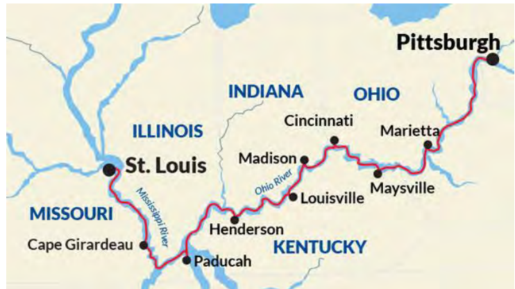
Map of Lewis and Clark National Historic Trail extension from near the confluence of the Ohio and Mississippi rivers to Pittsburgh.