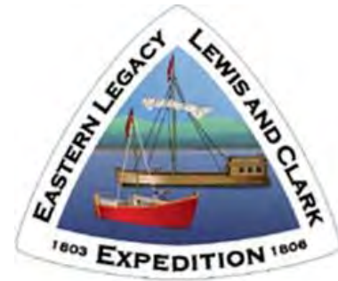
Eastern Legacy signage: A sign marker placed at sites and trailheads connected with the Lewis and Clark story in the Eastern Legacy. The signs were funded by grants from the Lewis and Clark Trail Heritage Foundation.

An example was a successful effort that resulted in the naming of a new 2,500-foot bridge across the Ohio River as the Lewis and Clark Bridge . The $763-million bridge, which was dedicated and opened for traffic in December 2016, connects Indiana and Kentucky at Louisville. The then Indiana Gov. Mike Pence , who is now the U.S. vice president, said in a statement at the time that the chosen name “Lewis and Clark” was an ode to Indiana and Kentucky’s shared historical prominence in the expeditions of Lewis and Clark .