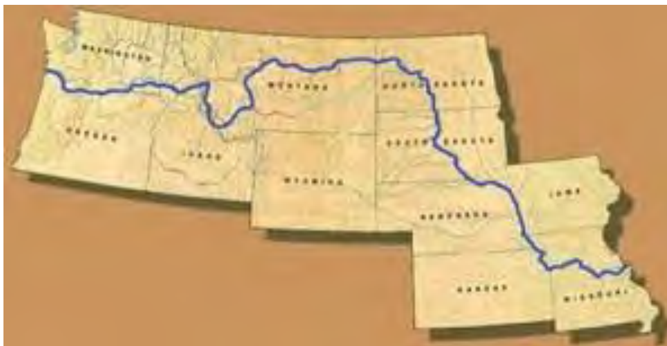
Map of the Lewis and Clark National Historic Trail as designated in 1978. The trail goes from Wood River, Illinois, to the mouth of the Columbia River in Oregon. Not shown on this map: the 1,200-mile extension of the trail east from Wood River to Pittsburgh. Map by Weber State University .

As an example, Loesch pointed to the possibility that, in the future, partnerships among agencies and volunteer groups might be developed to create a major trail system that loops from the East and goes west into North Dakota by connecting existing historic trails. Among the trails that could connect to make the loop are the 4,600-mile North Country National Scenic Trail , 1,444-mile Buckeye Trail , 78-mile Little Miami Scenic Trail , and the extended Lewis and Clark National Historic Trail.