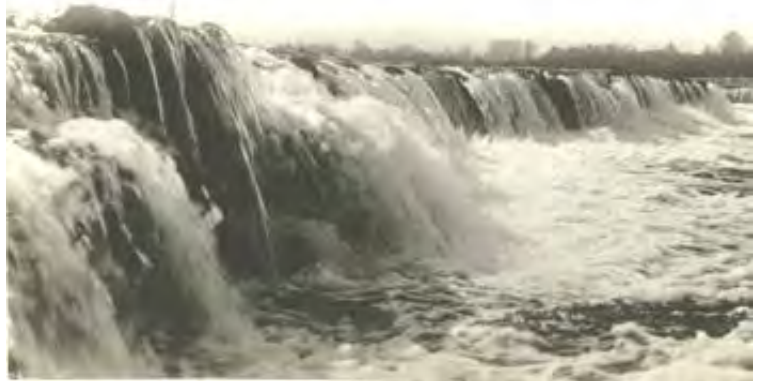
Falls of the Ohio: This photograph from 1928 is what the series of falls may have looked like when Lewis and Clark were there. In modern times, the river has been dammed and the falls and rapids that remain today have considerably less voracity. The falls pictured here were later inundated by a dam.

Cairo, Illinois . After leaving the mouth of the Ohio River and moving up the Mississippi River, the expedition camped near Cairo on Nov. 14, 1803. They paused for six days while the captains honed their surveying and mapping skills by practicing the technique of celestial observations . Clark used a surveyor's compass and chain to determine the widths of the Mississippi and Ohio Rivers : the Mississippi, 1,435 yards; Ohio, 1,274 yards. The confluence of the two rivers sprawled over 2,002 yards; in today's comparisons, the length of almost seven football fields.