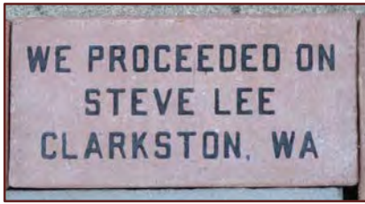
"Paver" purchased in support of the Litchfield Route 66 Museum & Visitor Center in Litchfield, IL.