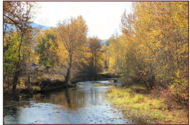
Lolo Creek at Travelers' Rest State Park near Missoula, MT, site of LCTHF's 55th Annual Meeting from June 27 to 30, 2023.

The theme of the meeting is Crossroads at Travelers' Rest...Trade, Travel & Time . Travelers' Rest State Park, where the Corps rested before and after crossing the mountains, now comprises their historic campsite among 65 acres of cottonwood forest along Lolo Creek. The Visitor Center includes exhibits and information about the Lewis and Clark Expedition and the Indigenous