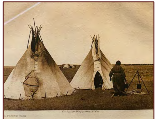
A Prairie Camp 1908.