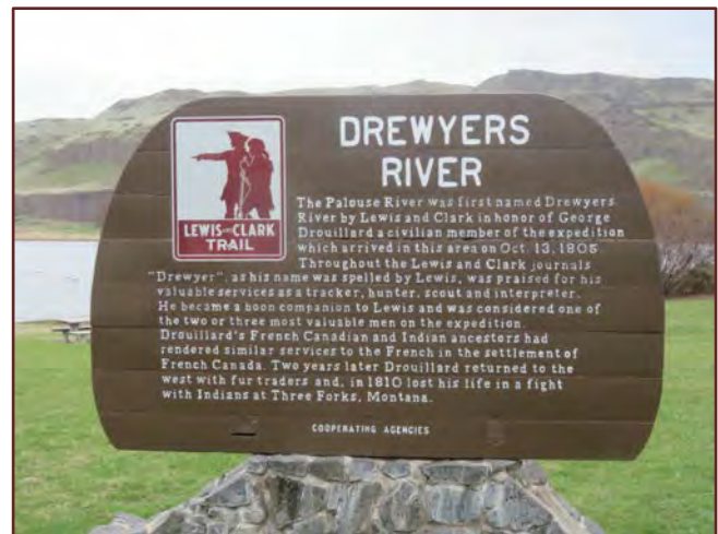
April 8, 2022: Drewyers River sign completed. Well done Washington Chapter!