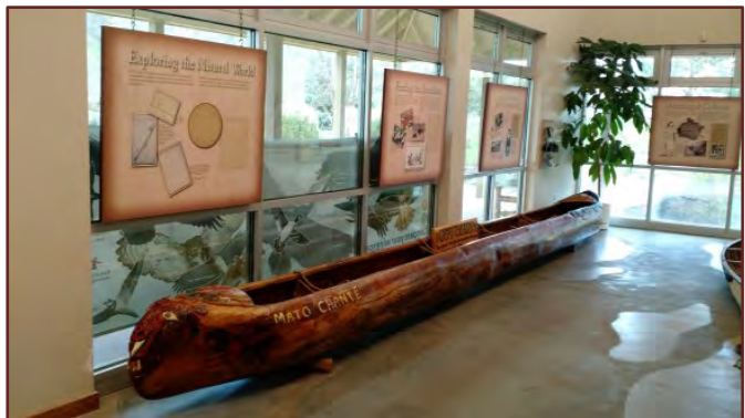
Mato Chante, a dugout canoe carved on the banks of the Clearwater 200 years after the Corps of Discovery carved theirs, was featured at the 4th Grade Rendezvous in Lewiston, ID.