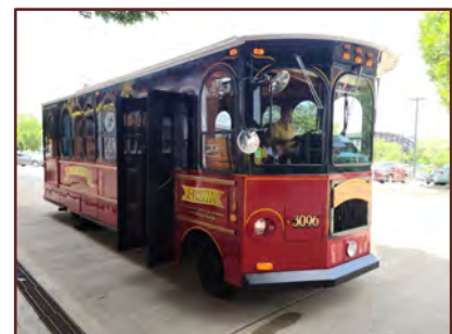
Molly's Trolley