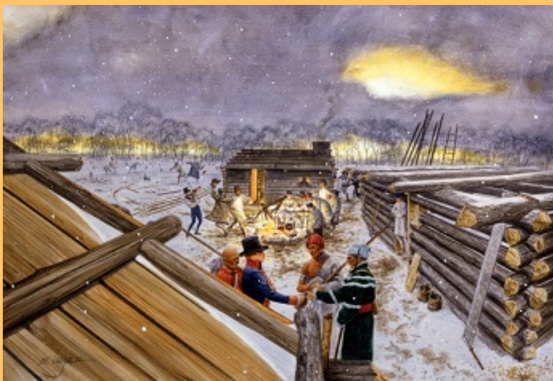
Christmas at Camp Dubois

The LCTHF wishes all our members, partners, and friends a happy holiday and new year to come!