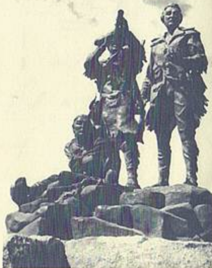
"We proceeded on," Lewis, Clark, Sacajawea and "Baby Fort".

The Lewis and Clark Back Country Byway is a cooperative effort of the Bureau of Land Management, the U.S. Forest Service, Lemhi County and the Salmon Valley Chamber of Commerce.