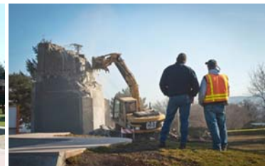
The Lewis & Clark Monument in The Dalles as it appeared in 1937 in an architect's rendition, in 2011 when inventoried by the Oregon Chapter, and in 2014 when demolished by the local park district.

without protection when no viable proposals for relocating the monument were received.