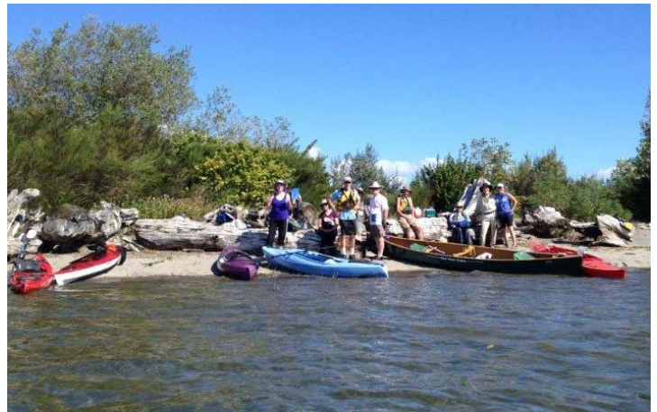
Eleven people and Murphy, the guide dog, used the tide and light breeze to go upriver on the September canoe paddle.

Watch this newsletter, your mail, your e-mail, and especially the chapter website for more information and details.