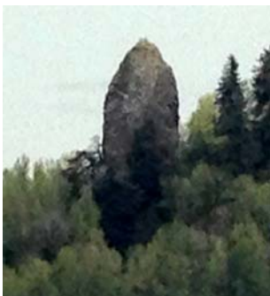
Rooster Rock—the Corps camped in this vicinity.