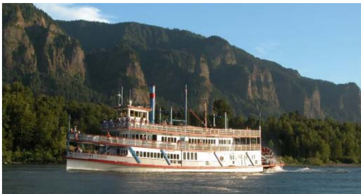
The Columbia Gorge sternwheeler on its namesake river.