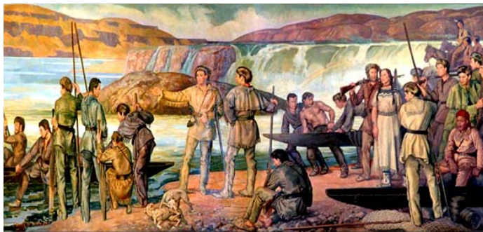
75 years ago: 1938 Oregon State Capitol art honors Lewis & Clark.