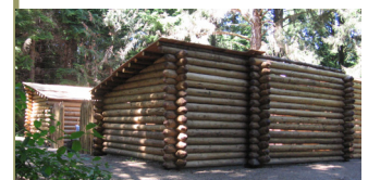
“Fort Clatsop III”, as seen during a Chapter tour in June 2006

You’ll notice that this newsletter is thinner than in the past. That’s because there is now far more L&C information available on our website!