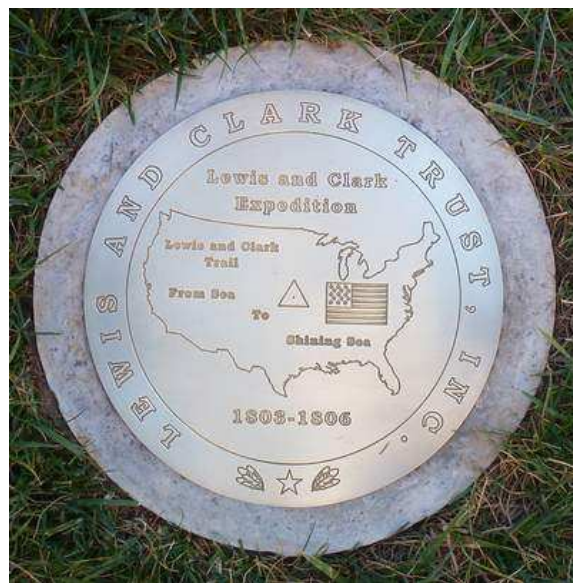
NOAA Monument dedicated November 3, 2012 at Courthouse in Fincastle, VA to commemorate the home of Julia Hancock and Lewis and Clark's visits to the area.

Please send your mailing address, phone number and email address along with your check to: