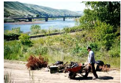
Hiking Sherman Peak in 1998; Meeting Sergeant Gass at Lewis and Clark Trail State Park in 2001; Cleanup at Arrow Junction in 2002

On June 2, 2000, members joined with Oregon Chapter members in Jordan Valley, Oregon, to restore the Jean Baptiste Charbonneau gravesite to a suitable condition after many years of neglect. The chapter also provided the materials needed for the restoration work.