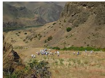
2010 Clearwater River tour participants pose in Orofino City Park; Pre-meeting and post-meeting trips to Hell's Canyon Ordway/Nez Perce village site

seen Lewis and Clark site – the Ordway site where three expedition members trekked to find salmon in 1806. Another enjoyable day was spent at Spalding Park that featured Nez Perce tribal dancers and Nez Perce horsemen. The event drew rave reviews from the members and the low-cost event came in under budget at the end. This also marked the first time in the Foundation's 42 year history that the meeting was hosted at a tribal enterprise and on an Indian reservation.