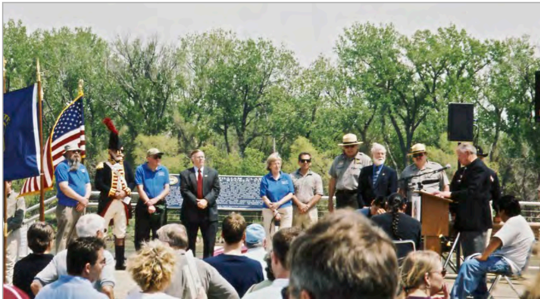
Dedication of Lewis & Clark Landing Riverfront Park, Omaha, NE