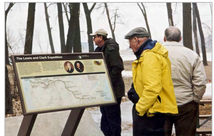
Interpretative Signage Lewis & Clark State Park (near Onawa, IA)