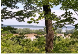
See page 2