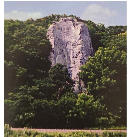
Sugar Loaf Rock.