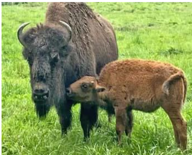
Latest edition to the BBL Bison herd