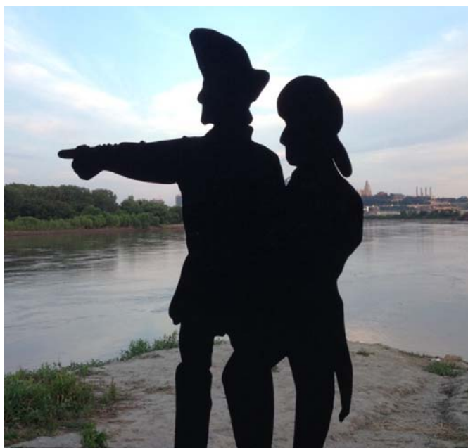
The confluence of the Missouri and Kansas Rivers, where the Corps camped June 26–29, 1804, and said this point would be a good location for a fort. Today’s Kansas City is in the background.