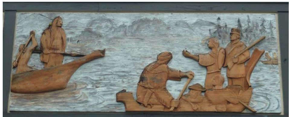
Lewis & Clark meet the locals in artwork adorning the exterior of “Hump’s Lounge”, a Clatskanie bar.