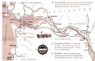
Excerpt, "Lewis & Clark on the Columbia River" map-guide.

Since its original publication, much new interpretation has been installed, in both Oregon and Washington. Over the next year we will work with the original cartographer, NPS, tribes, and chapter members to create a new version.