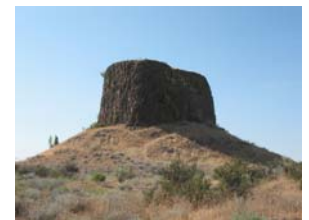
"A Rock resembling a Hat" in Umatilla County—one of the first major Oregon landmarks for the Corps.

Please check it for the latest updates on Chapter activities. We're sending fewer postcards, so watch the website for updates!