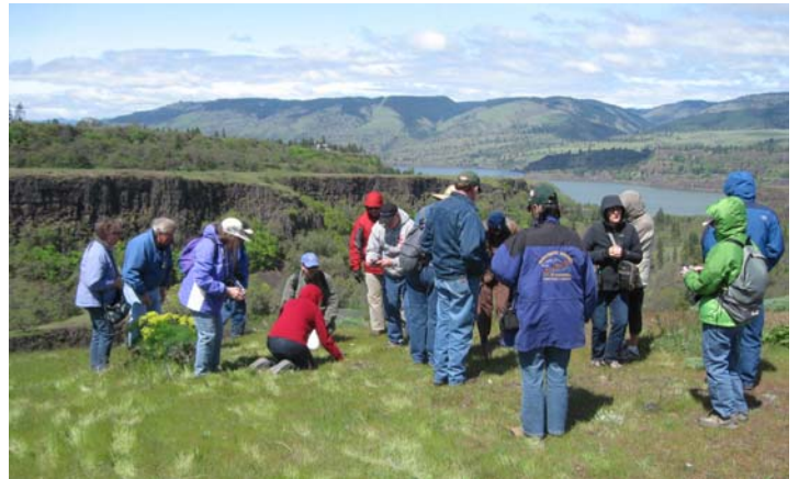
Chapter members enjoy the April 2012 wildflower hike in the Gorge.

Watch this newsletter, your mail, your e-mail, and especially the chapter website for more information and details.