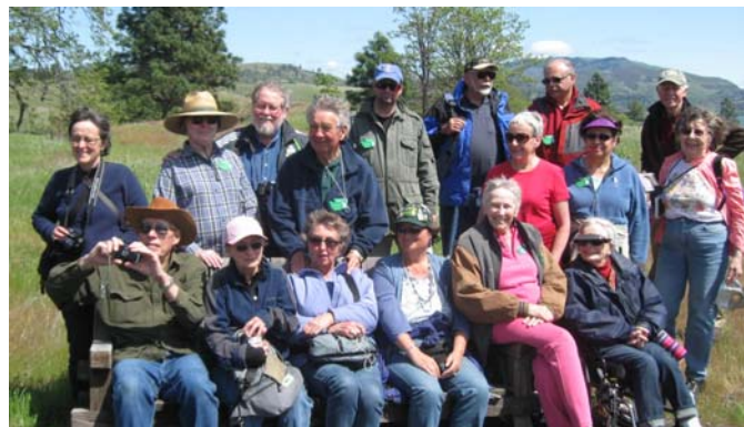
Happy participants in the April regional meeting which brought together members from Oregon, Washington, and Idaho chapters.

Springtime in the Gorge brought forth the wildflowers for our regional meeting, and fair weather brought nearly 40 chapter members from Oregon, Washington, and Idaho over the last weekend in April.