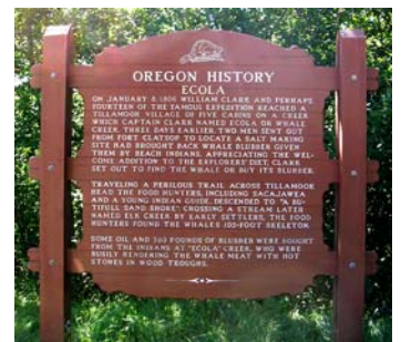
Beaver Board at Ecola State Park.