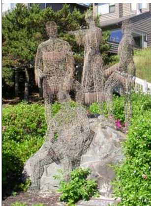
Wire sculpture of L&C members (Sacagawea in the center) at Breakers Point, Cannon Beach.

In September, chapter members helped the National Park Service test a viewshed evaluation tool, which will help safeguard L&C sites nationwide.