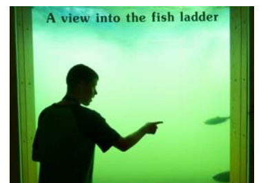
Viewing fish at Bonneville Dam.