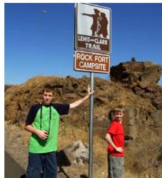
Scouts at Fort Rock, The Dalles.