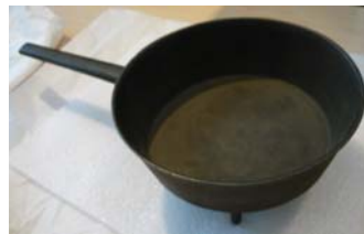
The "spider", a three-legged frying pan carried by the Expedition, seen in the collections of the Oregon Historical Society in January 2011.