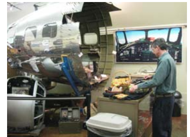
First in line for dinner behind the cockpit section of the Lacey Lady.

In October we visited the vintage B17 bomber and the Wings of Freedom Museum in Oak Grove, enjoying a delicious "wapato dinner".