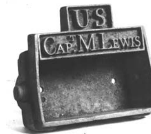
Meriwether Lewis's branding iron (reverse image).