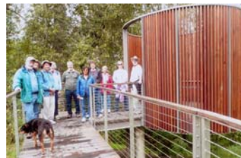
Intrepid hikers visit Maya Lin's Confluence Project bird blind at the Sandy River Delta

Our "captains" continue to plan exciting trips for us. Watch this newsletter, your mail, your e-mail, and especially the chapter website for more information/details.