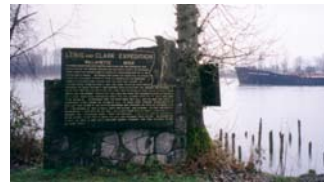
The old L&C sign at Kelley Point Park.

Meet at 1:00 for the potluck, then learn more about this important L&C site. Glen Kirkpatrick will orient members to the Corps' maps of the area, show