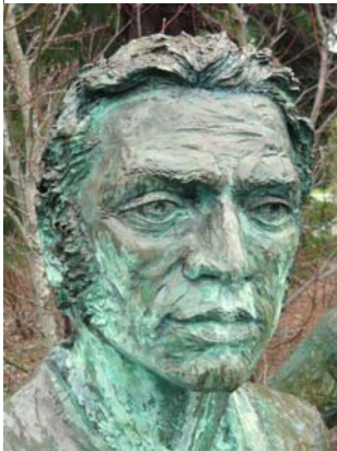
William Clark at the University of Portland.