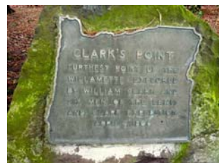
The (inaccurate) plaque hidden on the grounds of the University of Portland.