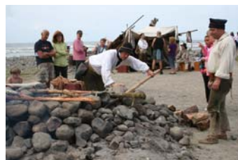
Making Salt on the Beach

The Saltmakers Return is an annual event sponsored by the Seaside Museum and Historical Society in conjunction with Fort Clatsop and the city of Seaside. In August, members of the Pacific Northwest Living Historians put on a 48-hour continuous interpretation of the Corps'