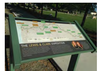
Close-up of Lewis & Clark Trail interpretive sign in Franklin Cemetery