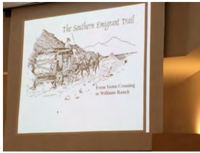
OnThe Southern Emigrant Trail

wagon road into California for the U.S. Military during the Mexican War. Much of this same route was used by the Butterfield Stage in the 1850's and by pioneers who came for the Gold Rush and to settle and farm or ranch all over Southern California.