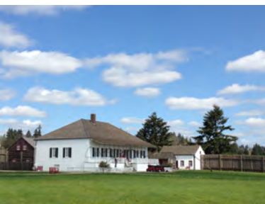
Building at Ft. Vancouver, WA

The Lewis and Clark Trail Heritage Foundation (LCTHF) and the Oregon-California Trails Association (OCTA) collaborated on the 2017 Symposium at the Heathman Lodge in Vancouver, WA, from March 31 to April 2. It was an outstanding success as more than 225 LCTHF and OCTA members attended the conference.