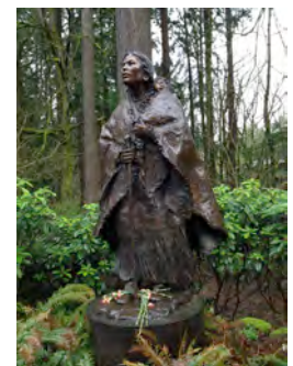
Statue of Sacagawea, Portland, Oregon

as Chairman of the Study for the Creation of the National Trails System Act received a special recognition award at the Symposium.