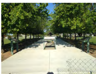
Interpretive sign recently installed in Franklin Cemetery