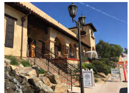
The Mormon Battalion Museum in Old Town of San Diego. Jean-Baptiste Charbonneau was hired as a Guide/Hunter for the Mormon Battalion that left Kansas on Aug.13, 1846 and arrived in San Diego on Jan. 29, 1847, a march of more than 2000 miles Volume 17, No. 1 (May 2017)