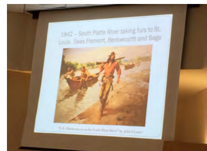
An artistic rendition of Jean-Baptiste Charbonneau by John Clymer