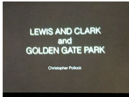
Title of Pollock's presentation