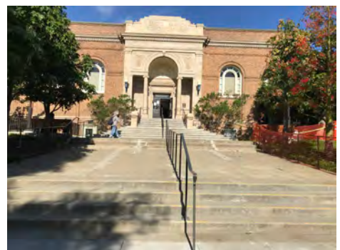
Presidio Branch Public Library, San Francisco, CA