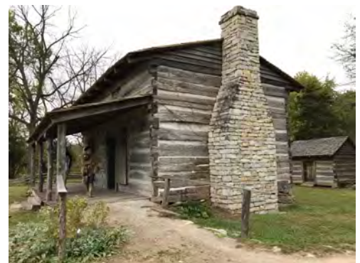
George Rogers Clark's cabin (departure site for Lewis & Clark) in Clarksville, IN