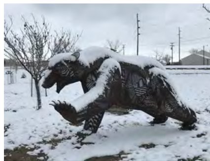
Statue of grizzly bear near site where Lewis encountered a bear