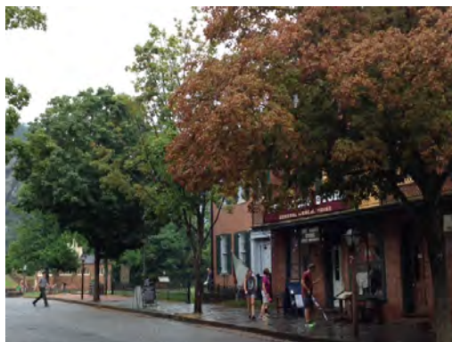
Harpers Ferry National Historical Park

The theme of the LCTHF's 48 th Annual Meeting focused on "Supplied for Survival: Meriwether Lewis at Harpers Ferry." The program highlighted Lewis's visit to the