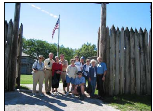
The Badger Chapter visits the Colter Memorial (left) and Fort Osage (right)