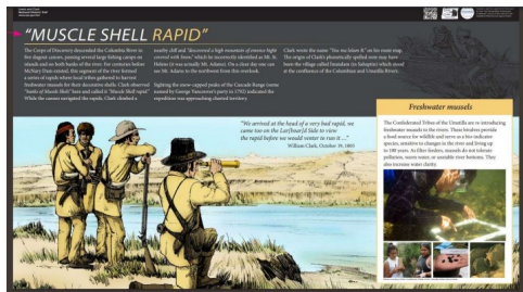
Screen capture of the new "Muscle Shell Rapid" sign at the McNary Dam Overlook. Notice the new inset highlighting efforts by the Confederated Tribes of the Umatilla Reservation to restore the freshwater mussel population.