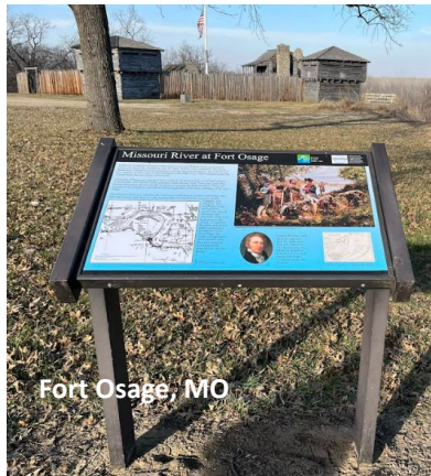
Fort Osage, MO