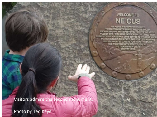
Visitors admire the second monument.

We have put more detail into the sculptures and focus on the history of the Ne’Cus village. We also added a third stone and a bronze plaque acknowledging the Trail Stewardship Endowment