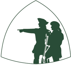
Lewis and Clark Trail Experience