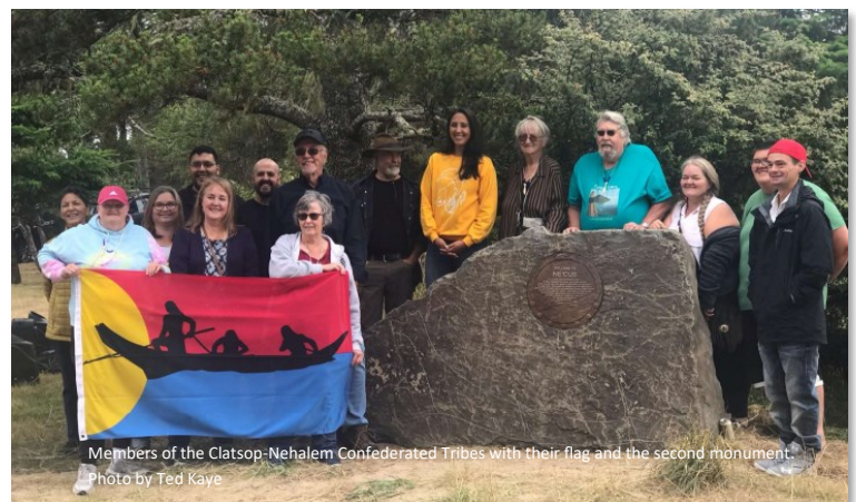
Members of the Clatsop-Nehalem Confederated Tribes with their flag and the second monument.

We dedicated the monuments with a ceremony and tribal salmon meal. Thanks to all who made this collaborative effort possible.