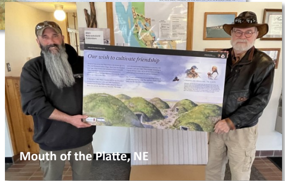
Mouth of the Platte, NE