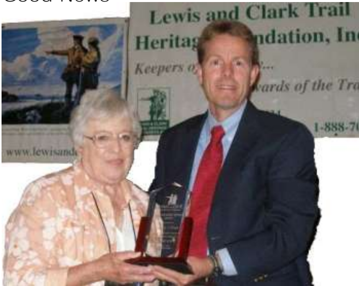
Distinguished Service Award Recipient