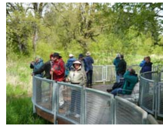
At the Tualatin National Wildlife Refuge in May 2009.

Watch this newsletter, your mail, your e-mail, and especially the chapter website for more information and details.