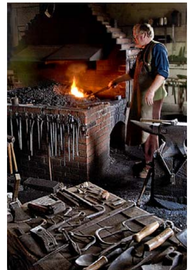
Our February 2008 visit to Fort Vancouver took us into the working blacksmith's shop.