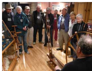
At the Aurora Colony Museum in May 2011.