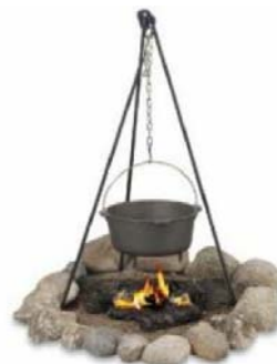
Replica Dutch oven suspended from a tripod.