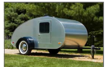
Lewis & Clark would have used one of these if they could!