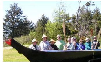
Paddles up at Fort Clatsop