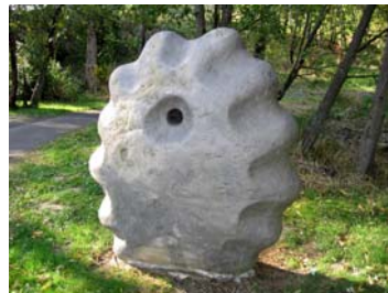
The Nichaqwli monument at Blue Lake Park—initiated by our chapter in 2005.

http://or-lcthf.org/Projects/Inventory.html