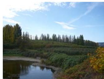
The alternative site, on the south bank of the Columbia, below a year-round spring.

Bolstered by a contingent from the Friends of the Columbia Gorge, the