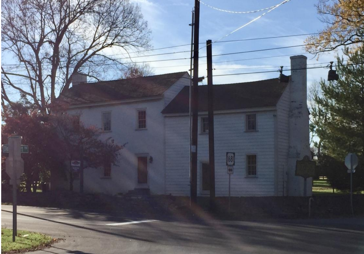
Submitted by Chuck Crase