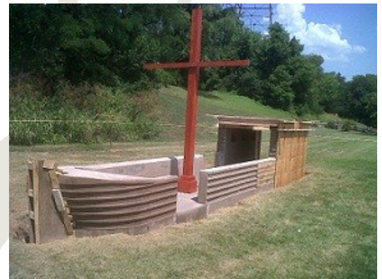
Ohio River Chapter 2011-2012 Grant Project ~ Design and Construction of a Replica Keelboat.

Special thanks to the Ohio River Chapter for hosting the Lewis and Clark Trail Heritage Foundation's 44th Annual Meeting.