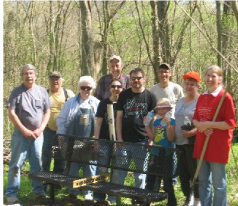
Manitou Bluffs Chapter