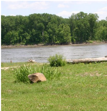
Greater St. Louis Metro Chapter