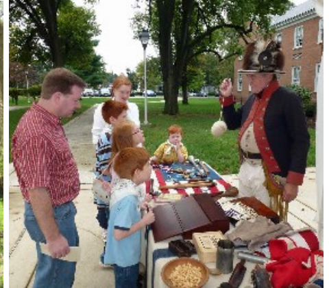
National Capital Chapter