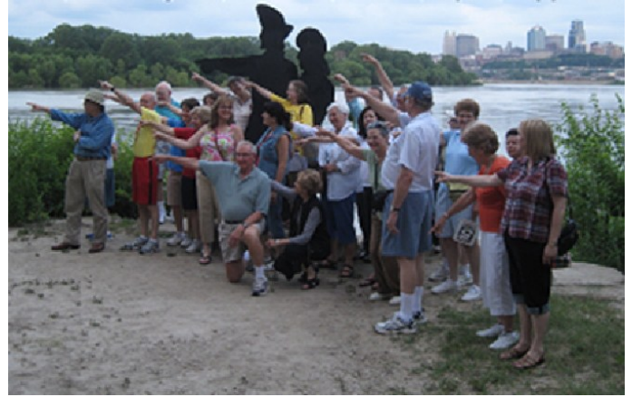
Missouri-Kansas River Bend