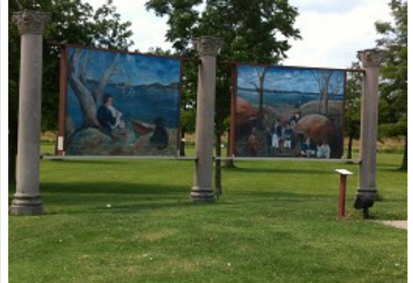
George Drouillard Chapter