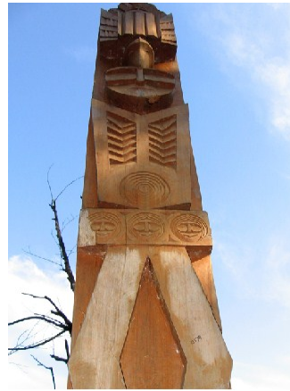
Confederated Tribes of Grand Ronde & Oregon Chapter