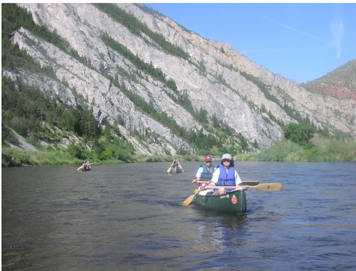
Jefferson River Canoe Trail Chapter