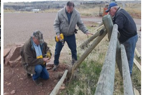
Portage Route Chapter