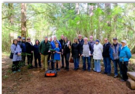
Oregon Chapter: The Hunt for Fort Clatsop

No grants were submitted for FY22. Be sure to submit your grant request for FY24 by October 1, 2023!